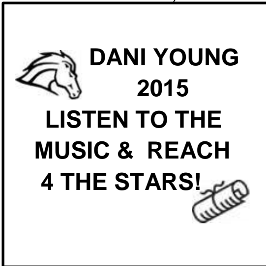
8 X 8 BRICK WITH GRADUATION ICON 15 CHARACTERS MAX., 6 LINES