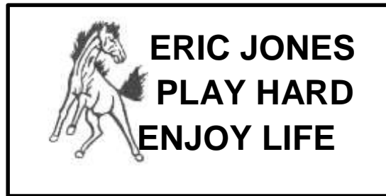
#2 MUSTANG ICON = 5 SPACES ON 3 LINES