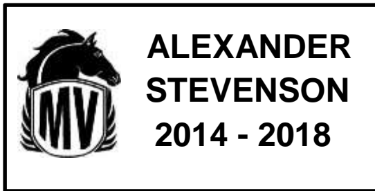
#1 MV CREST ICON = 6 SPACES ON 3 LINES