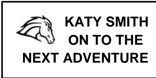
#3 HORSEHEAD ICON = 4 SPACES ON 2 LINES