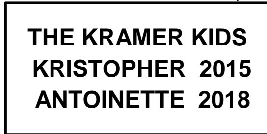
NO ICONS – 15 CHARACTERS MAX., 3 LINES